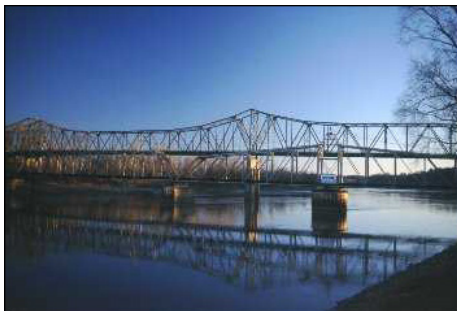
Existing Amelia Earhart Memorial Bridge and adjacent railroad bridge