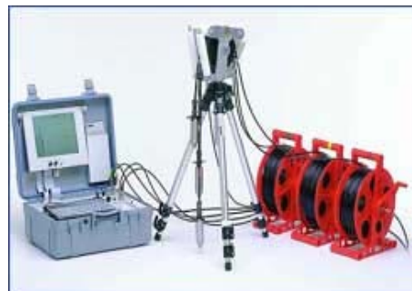
CSL Equipment from Olson