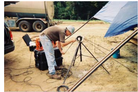
Test in progress

CSL tests are particularly well suited to larger foundation elements and can provide a means of testing the concrete integrity where low-strain impact integrity testing from the top of the pile may fail to be effective.