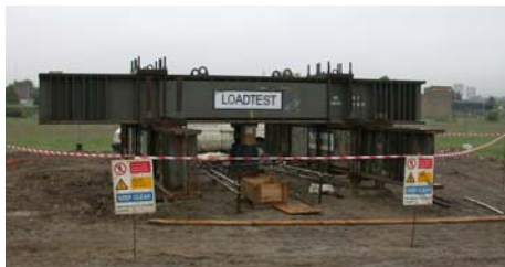
Figure 1. A 12MN Reaction system

The data may be presented on screen in tabular and graphical forms and printed results can be readily obtained, making reporting easy and fast. Over 3000 computer controlled loads tests have been carried out using this patented system. (U.K. Patent No. 2323174)