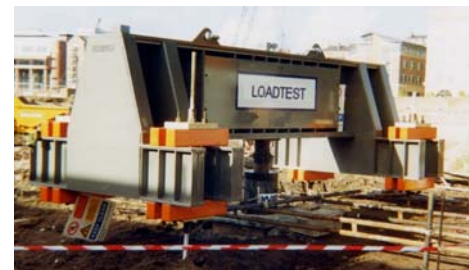
Figure 4. – 4MN CRAFT set up on 4 anchors with 4 Dywidag bars

Compatible with a 4 anchor arrangement set on a 4x1.5m spacing, the 4MN systems are a very compact reaction solution.