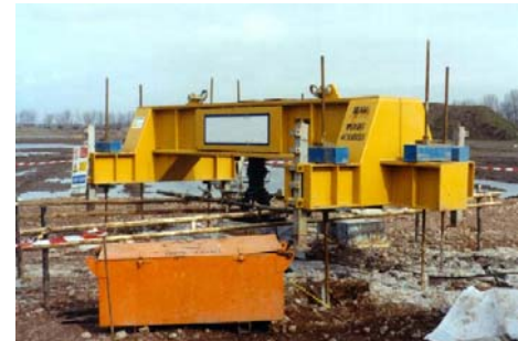
Figure 3. - 2MN CRAFT set up on 6 anchors with 6 Dywidag bars

The 2MN arrangements can be connected to 2, 4 or 6 anchors arranged on a 4x1.5m and 5m spacing.