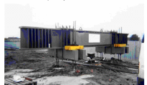
Figure 5. – 5.5MN CRAFT set up on 4 anchors with 8 Dywidag bars

The 5.5MN arrangement requires 4 anchors arranged on a 4x1.5m or 4x2.5m. The spacing of the secondary beams can be increased to 5m but with a reduction in maximum capacity.