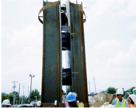
Two 16 MN (3600 kip) O-cell® used to test the lateral stiffness of the Cooper Marl (between 19-21 m depth) on a 2400 mm (96") pile for the Cooper River Bridge.

The O-cell® method for testing the lateral stiffness of a foundation element provides numerous advantages over conventional lateral loading tests.