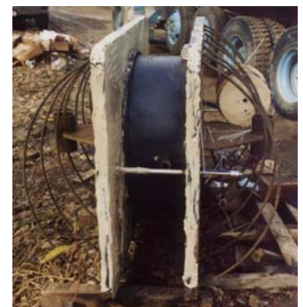
A 27MN (6000 kip) O-cell® used to test a 1500 mm (5') long by 1200 mm (4') diameter rock socket. Bearing plates are greased along the inside plane to facilitate concrete de-bonding.

Shaft/pile diameter permitting, split-cylinder lateral tests may be performed over a wide range of loads: from 1 MN to 27 MN (150 to 6,000 kips) using a single O-cell. With multiple O-cells, the vertical length of the tested zone can be increased and larger loads may be applied.