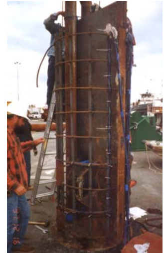
An O-cell® assembly is prepared for installation using two 4 MN (900 kip) cells for use in a 1200 mm (48") diameter shaft.

The O-cell® method is well suited for any size and capacity drilled shaft or pile, for tests both on land and off-shore.