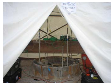
Bi-directional test in progress. The steel beam shown in the picture is being used as a reference frame against which pile movement was measured.

The load test was carried out mobilising the whole of the 225mm stroke available. Approximately 110 mm of upward movement and approximately 115 mm of downward movement were mobilised.