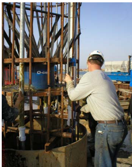
Installation of reinforcing cage with O-cell

When pressurised, one element of the pile is used as a reaction for the other; in this manner no reaction system is needed at the surface and no anchor pile nor kentledge are required.