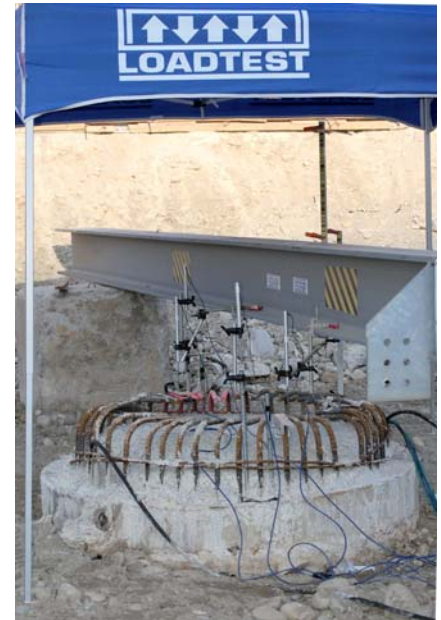
Pile head test arrangement showing reference beam

allowing a predicted settlement from the top of the pile of approximately 6.2mm under the working load of 15MN. These values were within the load settlement criteria and the pile was successfully incorporated into the structure.