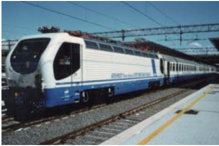
High speed train reaching speeds of 300km/h

A new high speed railway line from Genoa to Milan required interconnecting the new infrastructure with the Giovi, Genoa - La Spezia, Genoa-Turin and Alessandria-Piacenza lines, and involving the interports of Rivalta Scrivia and Milan South. This involved the construction of several new high speed railway lines taking trains at speeds of 300km/h.