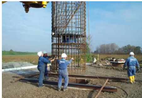
Installation of pile cage with O-cell assembly

Sister bar vibrating wire strain gauges were placed at levels along the pile shaft allowing a profile of net unit side shear to be determined as mobilised along the pile shaft.