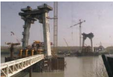
Construction of the bridge underway

As part of this project, Piacenza became the site for the first Osterberg Cell tests to be performed in Italy.