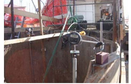
Pile test in progress

The mobilised capacities for the piles were 66 MN and 69 MN respectively.