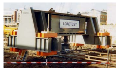
Figure 4. – 4MN CRAFT set up on 4 anchors with 4 Dywidag bars

Compatible with a 4 anchor arrangement set on a 4x1.5m spacing, the 4MN systems are a very compact reaction solution.