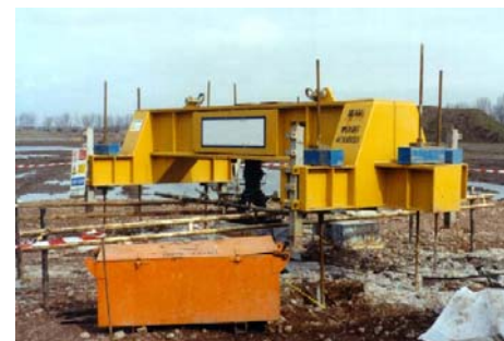
Figure 3. - 2MN CRAFT set up on 6 anchors with 6 Dywidag bars

The 2MN arrangements can be connected to 2, 4 or 6 anchors arranged on a 4x1.5m and 5m spacing.