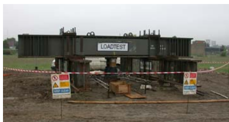
Figure 1. A 12MN Reaction system

The data may be presented on screen in tabular and graphical forms and printed results can be readily obtained, making reporting easy and fast. Over 3000 computer controlled loads tests have been carried out using this patented system (U.K. Patent No. 2323174)