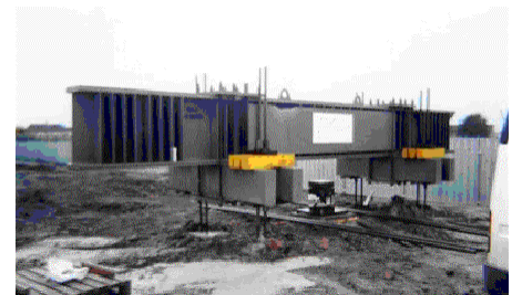
Figure 5. – 5.5MN CRAFT set up on 4 anchors with 8 Dywidag bars

The 5.5MN arrangement requires 4 anchors arranged on a 4x1.5m or 4x2.5m. The spacing of the secondary beams can be increased to 5m but with a reduction in maximum capacity.